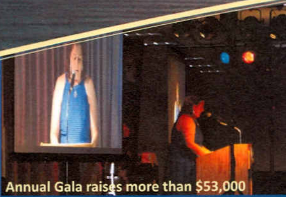
Annual Gala raises more than $53,000